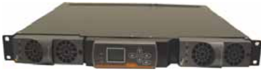
48V/540Wx2, 1.08kW 1U Energy Shelf M/N. HR8057-001

The 1080W/540W energy shelf is specially designed for the -48V art switching mode rectifier and advanced microprocessor technology, the shelf is able to perform efficient AC to DC power conversion. The energy shelf is N+1 redundant design with hot swappable capability, hence, particular easy and convenient for maintenance. The shelf is particularly suited for mobile communication base station, switch exchanges, optical fiber communications, microwave base station and others -48V telecommunications equipment.